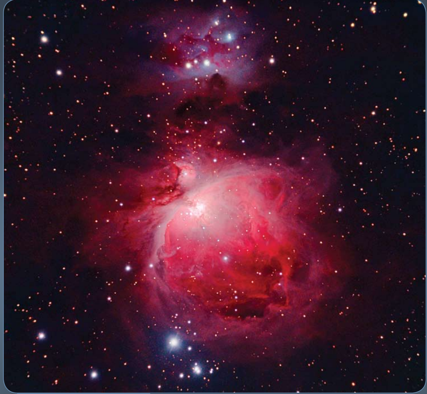
Orion and The Running Man Nebula

This publication is designed to reveal the exciting world of astrophotography to anyone who may be interested in imaging the night sky. Astrophotography combines the magnifying and light gathering capabilities of a telescope with the camera's ability to record that light into an image. In the following pages, we will introduce you to various techniques for capturing images of celestial objects. From the easy and inexpensive to the precision long exposure imaging that requires more advanced equipment. We hope the information presented in this booklet will have you as intrigued with this fascinating hobby as many of us are, here at Celestron.