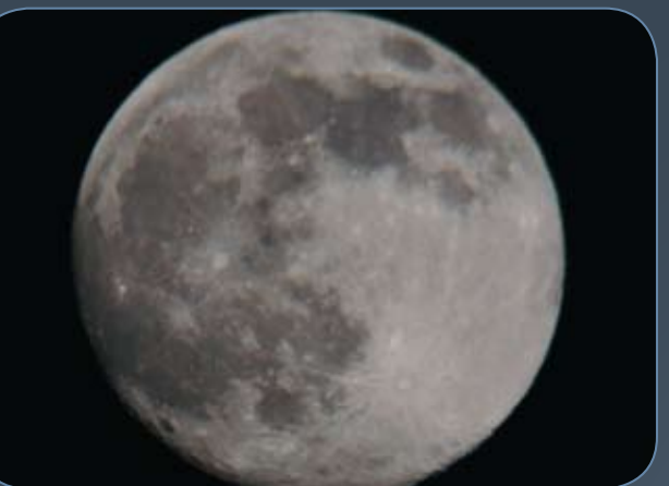
Full Moon by Kevin Kawai

Optional Equipment: Additional Eyepieces to vary magnification.