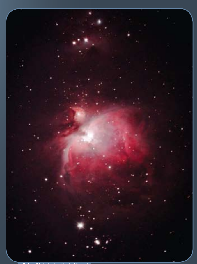
Orion Nebula by Kevin Kawai

Optional Equipment: Vibration Suppression Pads.